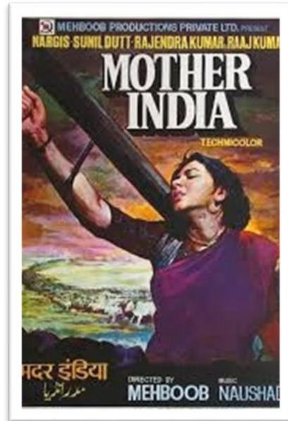
Mother India, an iconic Indian film