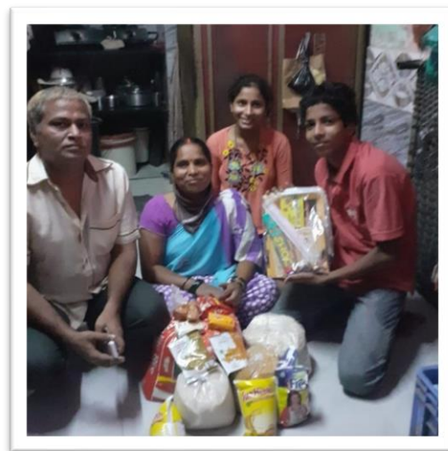
Right: An Aseema family with their food ration kit