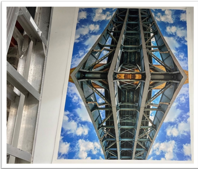
A Larger Pittsburgh Bridge

“Aseema is a model for change anywhere.”