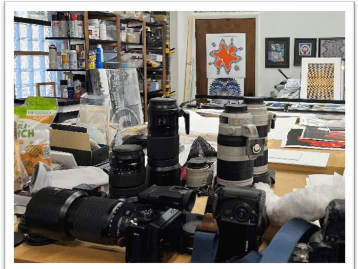
Rob’s Camera Collection